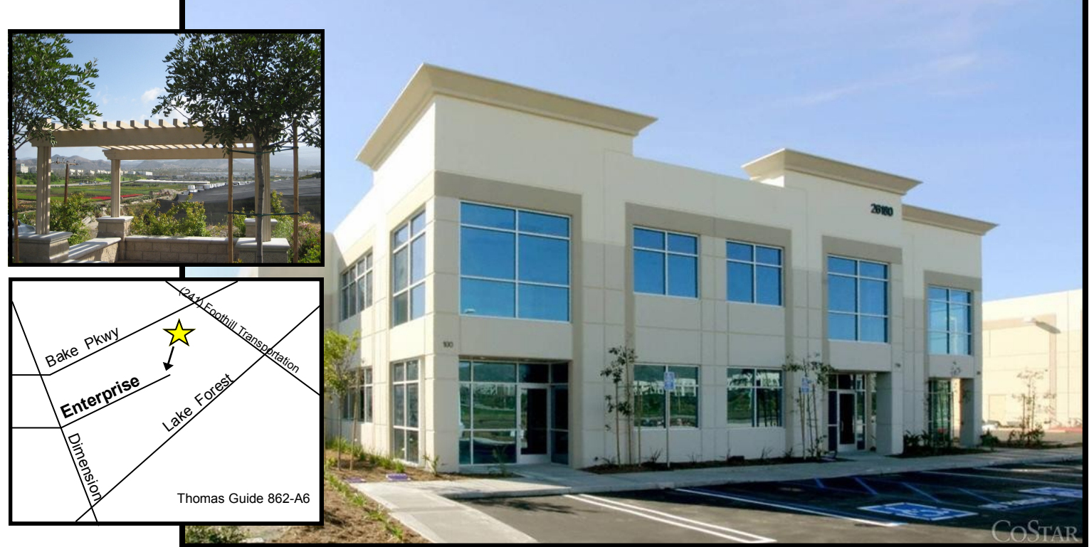
26180 ENTERPRISE WAY, SUITE 200B LAKE FOREST